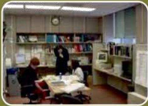
Drug Information Centre