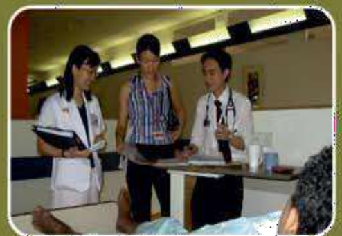
Ward Round Participation