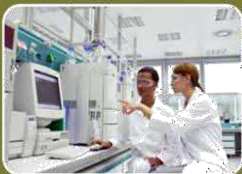
Bio Analytical Research